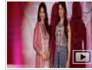
Juhi afraid of comparisons with Madhuri