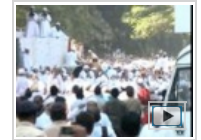
Stampede kills 18 in Mumbai