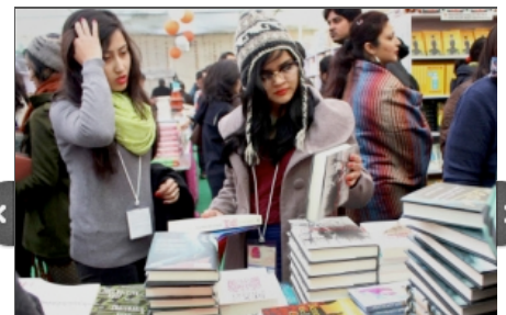
Visitors browsing through books during the ongoing Jaipur Literature Festival in Jaipur on Sunday